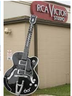
RCA Studio ▶

$650 double, $750 single. $300 non-refundable deposit by check payable to Travel Leaders given to Deb will hold your spot. Includes Meadowood coach, overnight at Opryland Hotel, 7 attractions, 1 breakfast, 2 lunches, 1 dinner, and escort. Itinerary is subject to change. Optional trip insurance $55 per person. For a complete itinerary and answers, contact Mark Kraner at 812-330-4375 x304 or MKraner@5ssl.com.