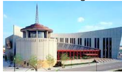
▲ Country Music Hall of Fame