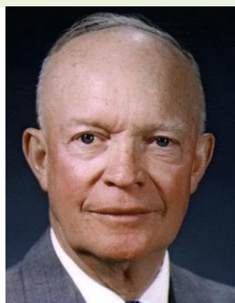
Dwight David Eisenhower