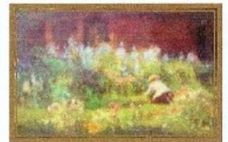
"Selma in the Garden"

Broiled Lemon Pepper Tilapia or Vegetable Quiche Bibb and Watercress Salad with Grapefruit and Avocado Rice Pilaf and Fresh Vegetables Assorted Individual Sized Desserts Water, Iced Tea and Coffee