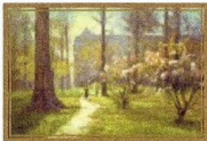
"Magnolias in Bloom, IU Campus"